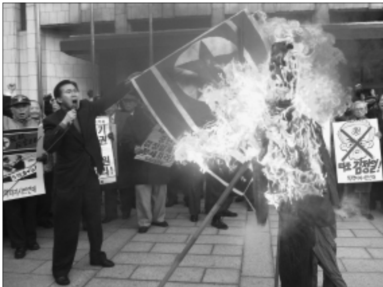
Protesters in Seoul, South Korea, burn a North Korean flag and an effigy of Kim Jong Il on Dec. 28, 2003, calling on North Korea’s leader to end the country’s efforts to build a nuclear bomb.