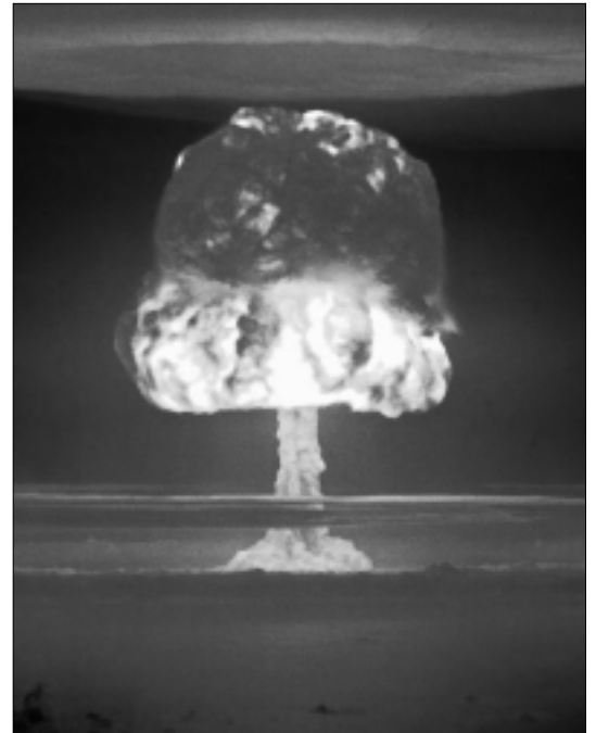
The mushroom cloud from Romeo, an 11-megaton hydrogen bomb, rises over Bikini Atoll in the South Pacific on March 26, 1954.

T he recent discovery of a global black market in nuclear weapons and related technology has intensified concerns that so-called rogue nations and terrorist organizations like Osama bin Laden's al Qaeda network might acquire nuclear bombs. The network run by the "father" of Pakistan's atomic bomb, A.Q. Khan, sold nuclear-weapons materials to Iran and North Korea, which have refused to sign the Nuclear Non-Proliferation Treaty (NPT). Virtually all the other nations of the world are signatories. President Bush responded to the revelations about Khan's network with a plan to strengthen international anti-proliferation efforts, including calling on the U.N. Security Council to require all states to criminalize proliferation of components that could be used to make weapons of mass destruction. While arms experts commended the president for focusing on proliferation, some said his proposals did not go far enough.