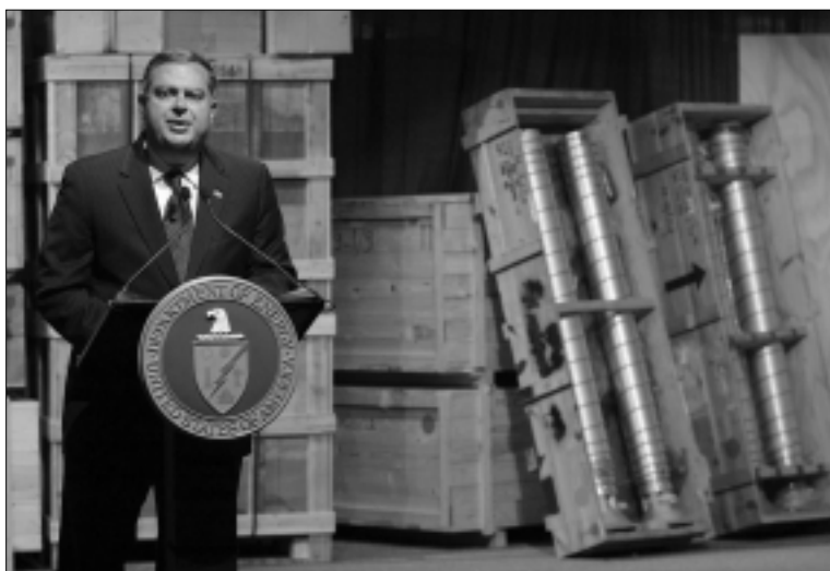
Components from Libya’s nuclear weapons program are displayed by Secretary of Energy Spencer Abraham at the Y-12 National Security Complex in Oak Ridge, Tenn., on March 15, 2004. Libyan leader Muammar el-Qaddafi ended the country’s isolation by renouncing weapons of mass destruction and joining the world nonproliferation regime.

nuclear-armed country to voluntarily dismantle its entire nuclear-weapon program.