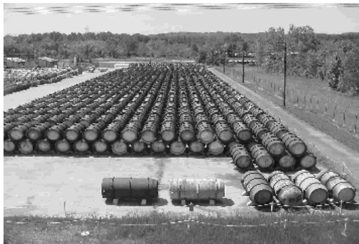
Figuur 1: opslagplaats DU