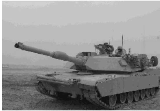
Figuur 2: een M1A1 tank in Irak

Militair wordt DU toegepast in antitankgranaten van klein tot groot kaliber. De kleinere typen van 20mm, 25mm en 30mm worden gebruikt door gevechtsvoertuigen en vliegtuigen. De grotere typen van 105mm, 120mm en 125mm munitie worden gebruikt door tanks. Verder wordt DU in de vorm van platen metaal gemonteerd in de bepantsering van pantservoertuigen en tanks. De Amerikaanse M1 en de M1A1 (en M1A2) Abrams tanks, en de Britse Challenger tank schoten tijdens de Golfoorlog van 1991 en de Irak-oorlog van 2003 met 105mm (M1 tank) en 120mm munitie. Ook bijvoorbeeld Franse, Russische en Chinese tanks kunnen schieten met uraniumhoudende munitie.