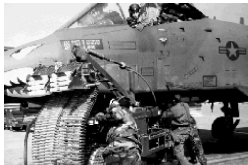
Figuur 4: 30mm DU-munitie wordt geladen in het boordkanon van de A-10

DU-munitie is ontwikkeld voor het schieten op gepantserde doelen, maar bij de Kosovo-oorlog (1999) en de Irak-oorlog in 2003 werd duidelijk dat er ook op gebouwen werd geschoten. Zoals in Bagdad bij een aanval op het ministerie van Binnenlandse Zaken. Alles daaromheen raakte besmet met uraniumstof.