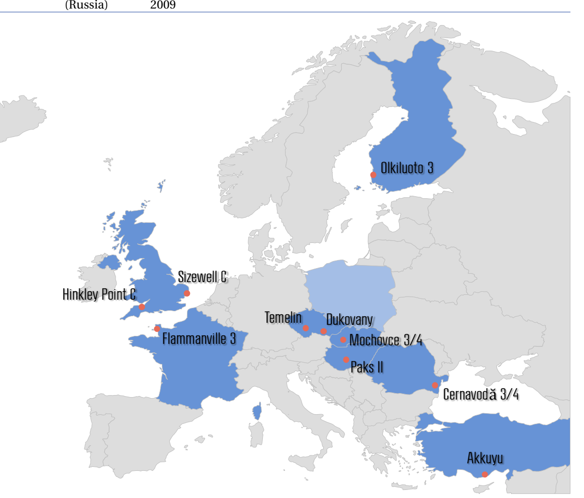
Figure 2: Recent European NPP projects and countries featured in this report. U.S. projects are not shown.

Table 3: Construction time and costs of recent NPP projects. Source: NEA 2020; IAEA 2023b – updated and expanded.