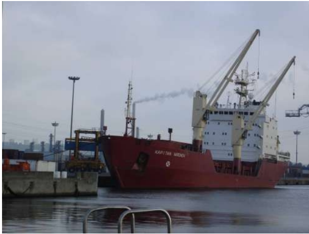
UF6 transport in Le Havre (France)