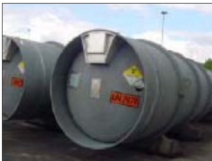
transport with shroud

The TS-R-1 requirements stipulate a unilateral approval H(U) requirement by 31 December 2003 being, essentially, satisfactory performance when subject to a structural internal pressure test of 2.76 MPa, 0.6m high drop test, survival of the 30 minute 800°C thermal (fire) engulfment. Low levels of enrichment (hence non-fissile) DUF6 containers when in transport have to bear the label ‘UN 2978’ with the proper shipping name ‘ RADIOACTIVE MATERIAL, URANIUM HEXAFLUORIDE ’. Other than the distinction between non-fissile and fissile consignments of UF 6 , all uranium hexafluoride (DUF6 or otherwise) has to be transported in IAEA TS-R-1 compliant containers (other than a transit mass of less than 0.1kg)