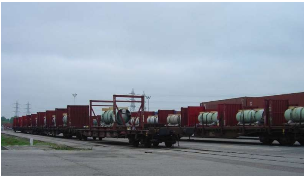
UF6 transport in France

The conclusion is that there are major issues of compliance with existing IAEA standards (which themselves are not robust in terms of real ship fire conditions).