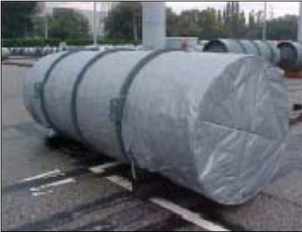
With thermal blanket

cannot agree (2003-4) on a general computer/calculation model to predict container performance under fire engulfment. Present 'solutions' to the doubts over thermal performance include thermal over-packs, and fire shields for the transport vehicles.