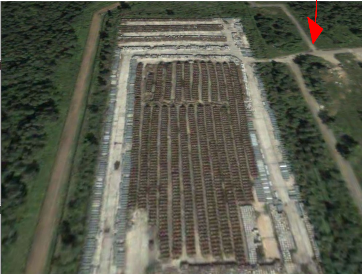
Satellite pictures of UF6 storage site at Tomsk-7 (Russia).