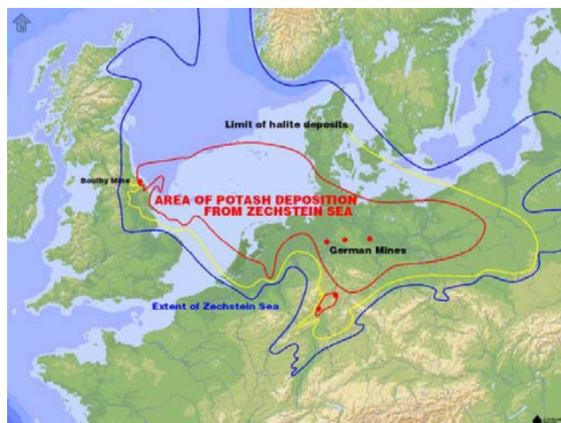
Fig. 2. Potentially suitable salt formations in the north-western part of Europe including the North Sea. The red area is of potential interest [10].

Access to the geology off-shore can be done from land with a tunnel. This is not fundamentally different than having an on land site for the whole disposal facility. The acceptable length of a tunnel will limit the off-shore locations to be considered. Off-shore activities can also be operated from an artificial island. Such an island can be constructed directly above the geologic formation selected as disposal site. Creation of artificial islands and reclaiming land from the sea is a well-known practice especially in the Netherlands. This has historical roots because the Netherlands is largely laying below sea-level. Over many centuries the Dutch had to protect their country against the water from the North Sea. Located in a delta of important European rivers the country also had to be protected against flooding from these rivers. Civil and hydraulic engineering as well as water management are Dutch skills. Artificial islands are not new and can be found all over the world. In the Stone Age they were created in Scotland and Iceland: the crannogs. Modern examples are Kansai airport in Japan and the astonishingly beautiful islands in Dubai: “the World” and “Palm” [11].