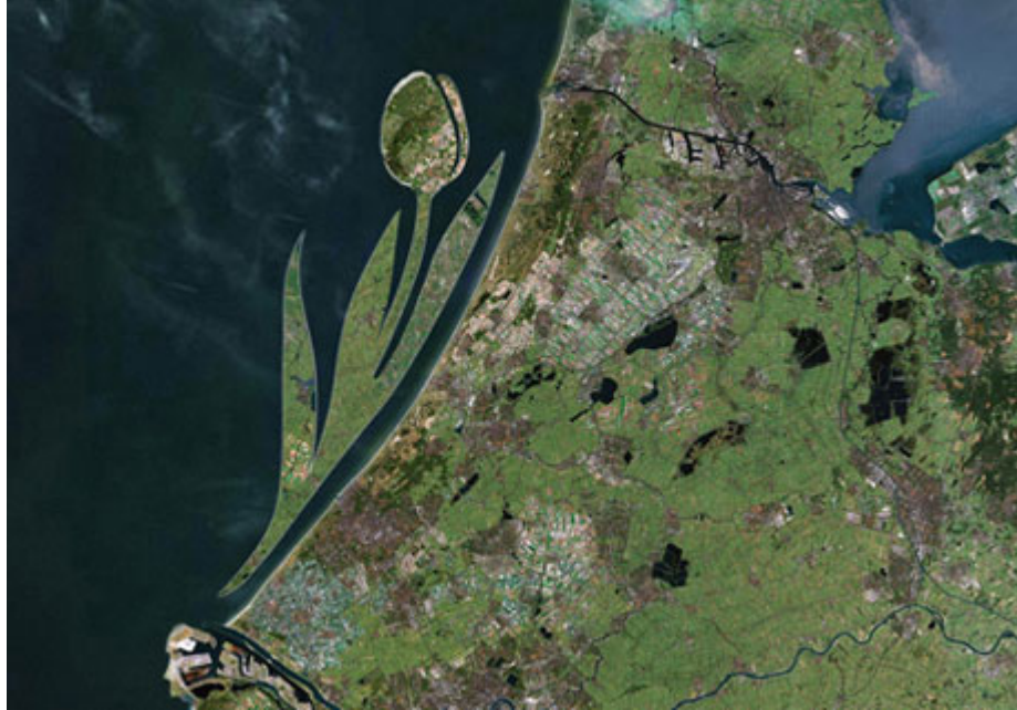
Fig. 3. “Tulip Island” in the North Sea [12]